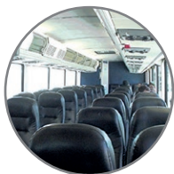
Aeroplane and bus and train interiors