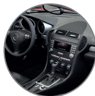
Dashboards, armrests and cup holders