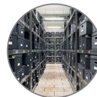
Document storage boxes