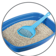
Cat litter trays