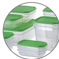
Food storage containers