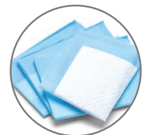
Hygiene products and medical textiles